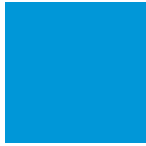
Azure Blue 052