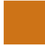
Nut Brown 083