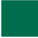
Forest Green 613