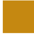
Copper (metallic) 092