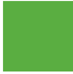
Lime-Tree Green 063