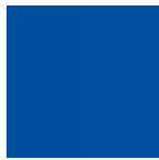
Traffic Blue 057