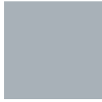
Silver Grey (metallic) 090