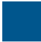
Gentian Blue 051