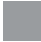
Middle Grey 074