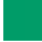
Light Green 062