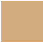
Light Brown 081